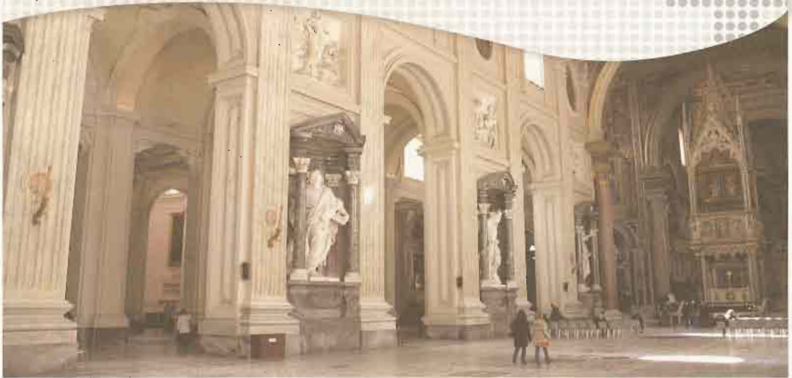
BAROQUE INTERIOR OF THE BASILICA OF ST. JOHN LATERAN

L ike other churches, the Basilica of St. John Lateran in Rome is built on the foundations—physical, historical, emotional and spiritual—of an earlier building. The Emperor Constantine commissioned the original church in the fourth century.