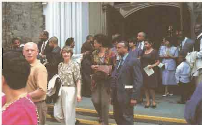
W.P. WITTMAN, LIMITED

Does this mean women are more religious? I hope not. I hope the men in our Church are just as religious and spiritual. But the imbalance in actual participation means the Church needs to go out of its way to do things that will nourish men spiritually. Retreats, Bible studies, social groups, and other activities geared specifically toward men are a great step. The Knights of Columbus have done a wonderful job of spiritually nurturing men and getting them involved in the Church.